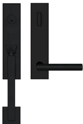
Rhodos – UET28 cosmos black