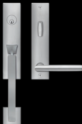
Verona – UETM37 satin stainless steel