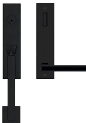
Madeira – UET45 cosmos black