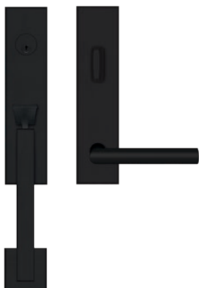
Rhodos – UETM28 cosmos black