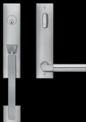
Tasmania – UET31 satin stainless steel