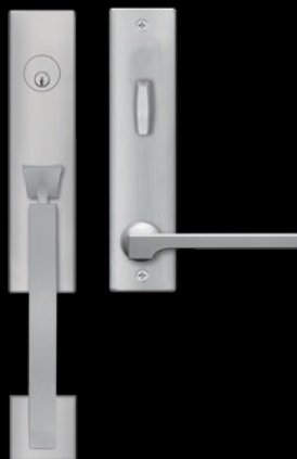
Soho – UETM57 satin stainless steel