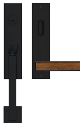
Torino – UETM53 cosmos black with Inlay rusic oak HE2