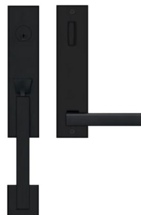
Seattle – UET46 cosmos black