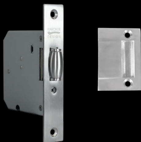
Roller latch UZ6000 with strike plate