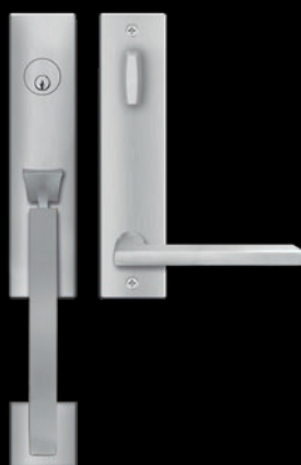
Montana – UET54 satin stainless steel