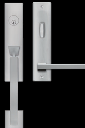
Boston – UETM58 satin stainless steel