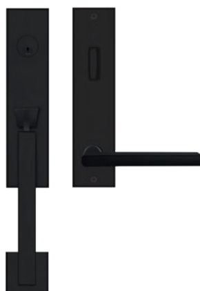
Montana – UETM54 cosmos black